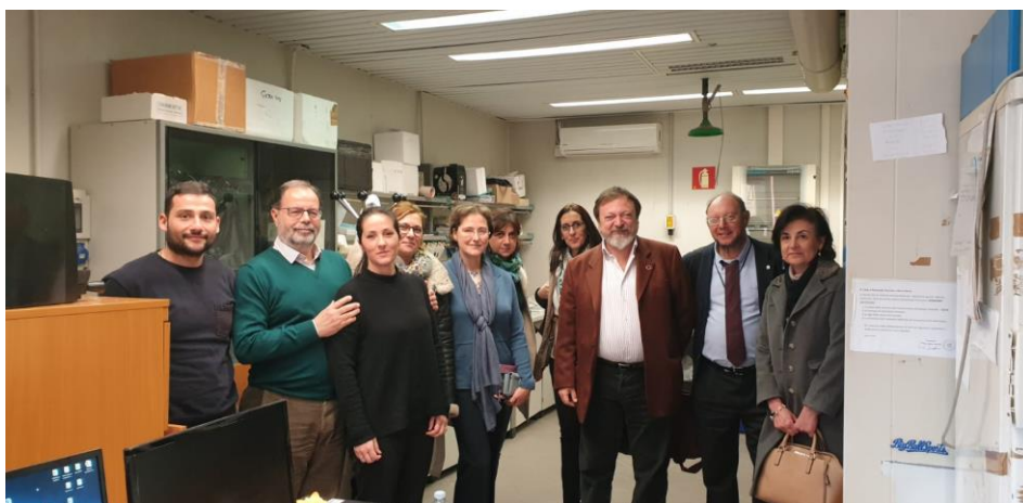
Naples, visit to the laboratory.