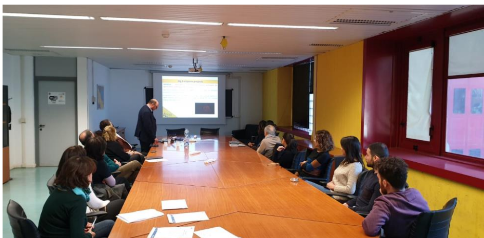
Naples, the President speech.

The two owners of the Ulysses Advisory Group expressed a great deal of interest, in particular they said that Italy, Spain and Portugal are Countries in which excellent research is certainly carried out, but often there are no tools to bring winning ideas to the market. Both stressed that they were impressed by the concreteness and the great potential of the Italian spin offs that presented their business. They believe that a lot of high-impact work can be done if there is a better linking between these Countries and the stream of private funding. They concluded by asking the two Italian partners to become, in the coming months, the vehicle for establishing direct contacts with researchers in life sciences who have patents or patentable ideas in Portugal and Spain too.